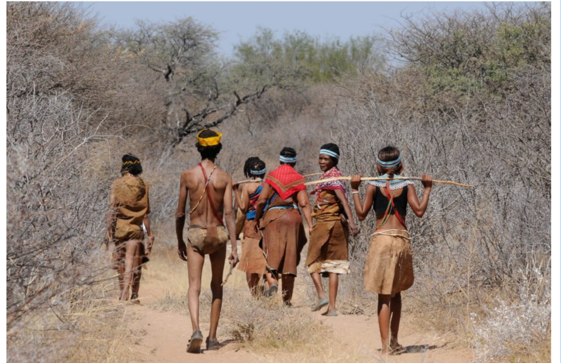
San tribe in Kalahari