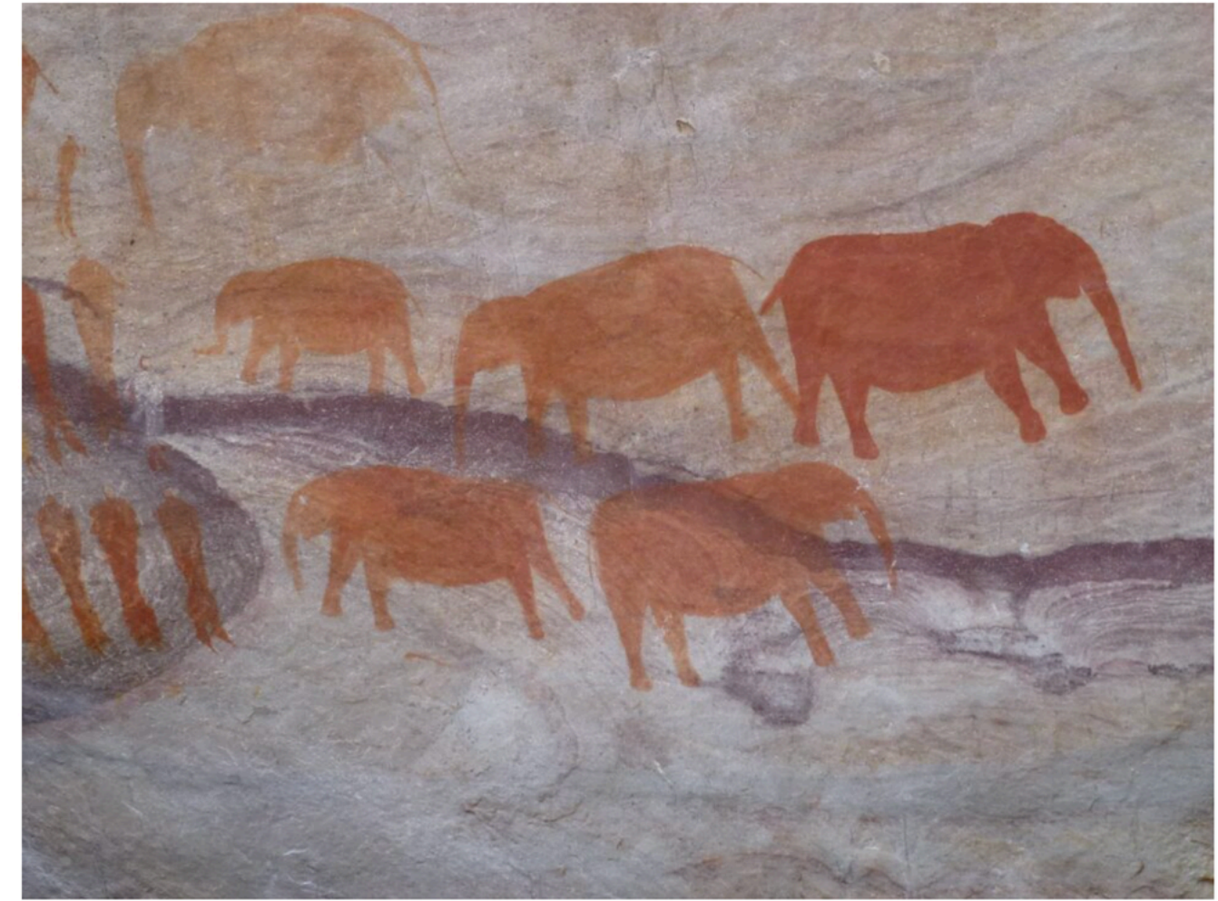
San cave paintings