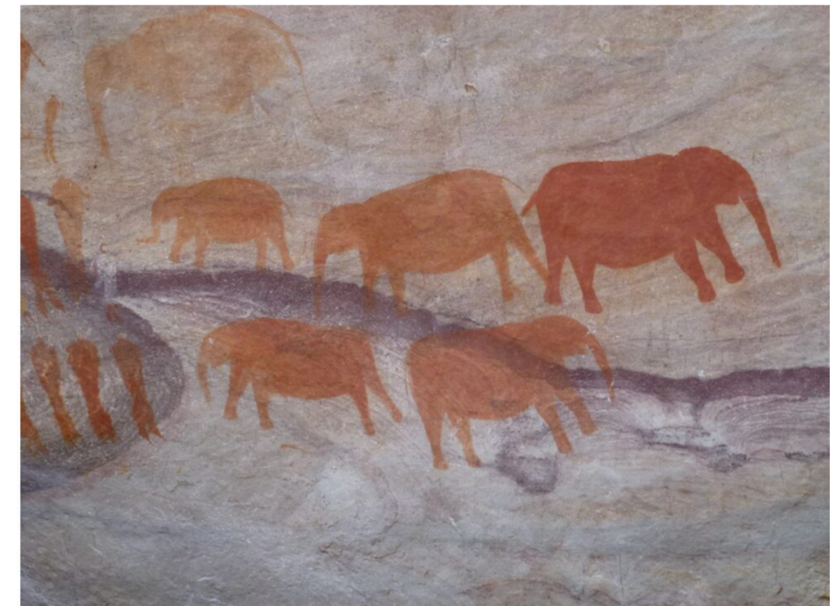
San cave paintings